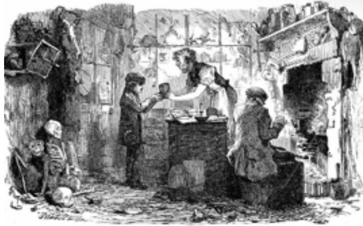
Mr. Venus surrounded by the Trophies of his Art by Marcus Stone.

III Week in, week out, from morn till night, You can hear the bellows blow; You can hear him swing his heavy sledge, With measured beat and slow, Like a sexton ringing the village bell, When the evening sun is low. The Village Blacksmith (1840)